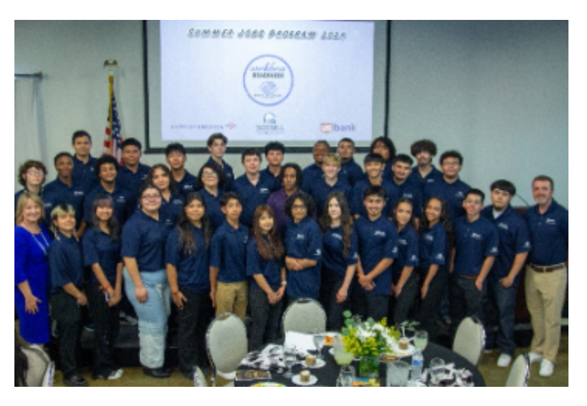
Boys & Girls Club of Kern County's 2024 Summer Jobs Program Graduation. 36 teens were hired by the Clubs and placed with one of 17 local companies and non-profit organizations in various trades for June to July 2024.

This year the California Alliance awarded a total of $1.4M+ to 90 Boys & Girls Clubs to support and build youth workforce readiness programs.